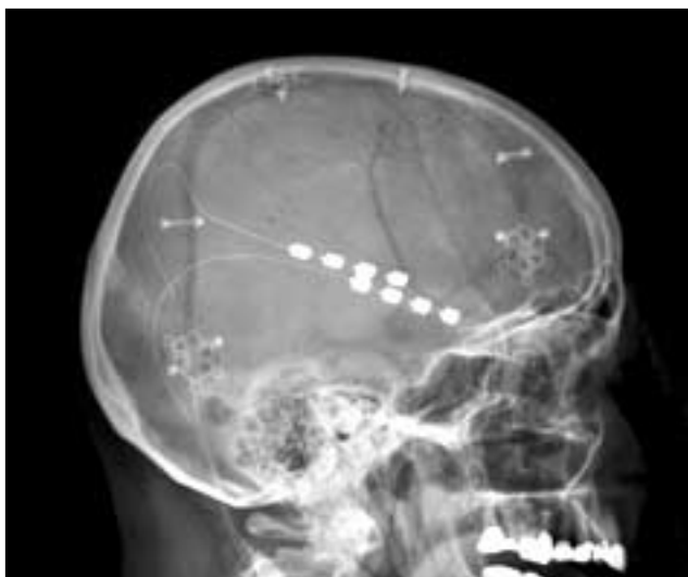
This lateral x-ray film shows two electrodes placed over the motor cortex to provide stimulation to relieve the patient's central pain syndrome. This was the first time the procedure was performed in this manner—the electrodes sit directly on the cerebral cortex to provide better stimulation, and two electrodes were used to stimulate a larger area of the cortex. After 4 months of stimulation, the pain relief was 100%.